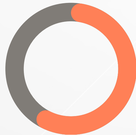
Operational Efficiency (60% inc.)