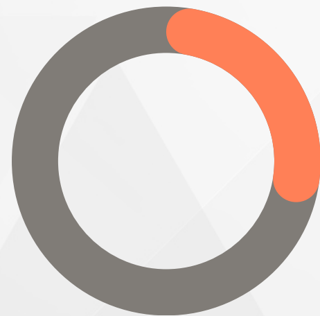
Cost reduction (30% inc.)

Cost reduction by 30% through automated data collection - Our custom-built scraping solution significantly reduced the client's resource allocation, thereby boosting operational efficiency and data accuracy.